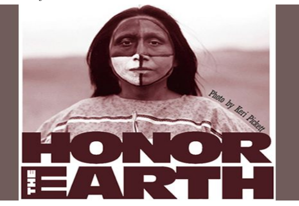
The mission is to facilitate the recovery of the original land base of the White Earth Indian Reservation (Ojibwe) while preserving and restoring traditional practices of sound land stewardship, language fluency, community development, and strengthening our spiritual and cultural heritage. (See welrp.org.)

2. Reparations to the White Earth Land Recovery Project in Minnesota